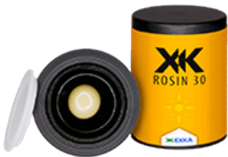
1g live rosin