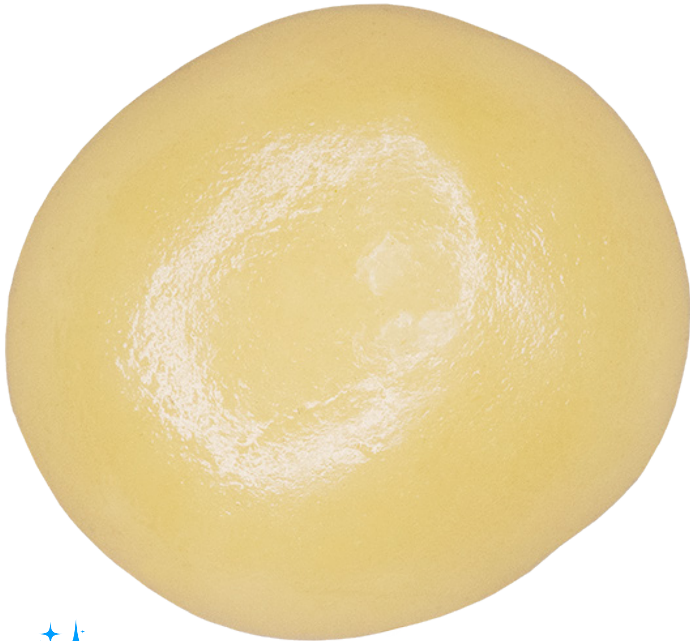
Best Selling 1g Rosin at SQDC