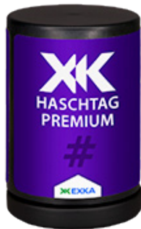
12 units per case