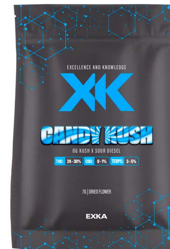
7g dried flower