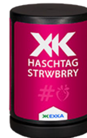
12 units per case