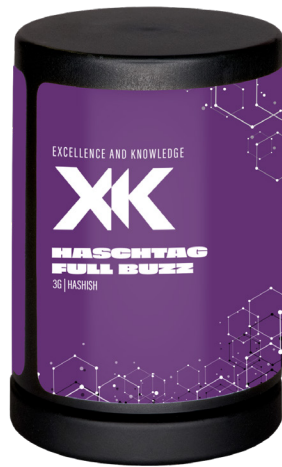
12 units per case