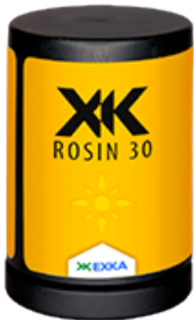
12 units per case