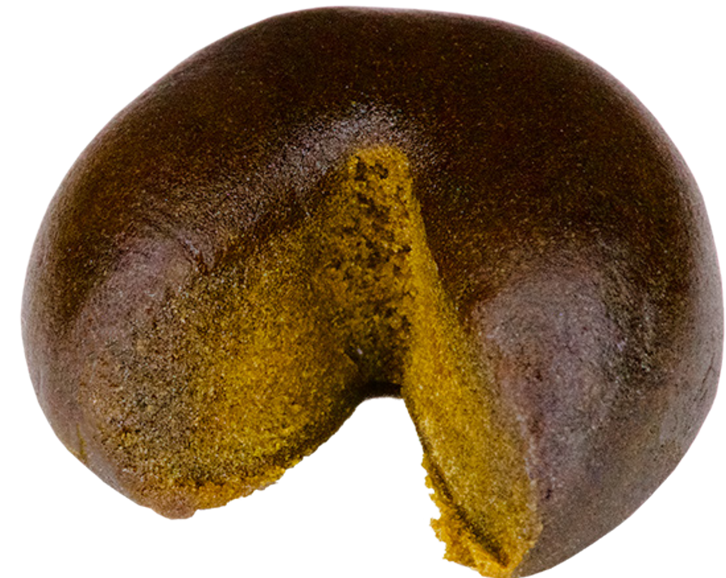
Strawberry Infused Hash